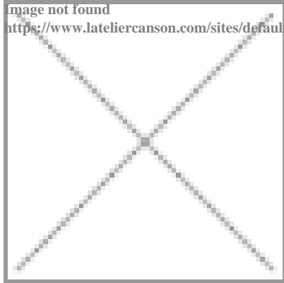
Image not found https://www.lateliercanson.com/sites/all/themes/passerelle/cansonconseils/canson_commons/images/link-a-arrow.png

Image not found https://www.lateliercanson.com/sites/default/files/styles/miniature___lire_aussi/public/Dessin%201557_0.jpg?itok=aoDs_oH3