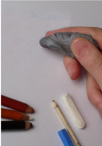
Zoom: Maintaining your erasers