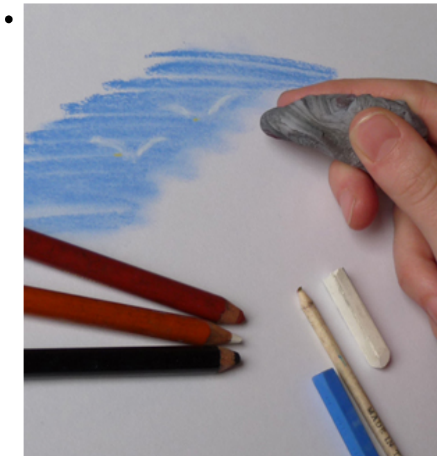
Mixing and stumping tools: cotton, cotton

swabs, rags, blotters, blender brushes, stumps (pointed sticks made from rolled paper)? and, of course, your hands!